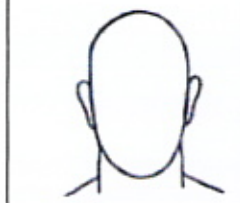
Ear Set :