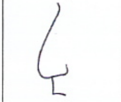
Nose Shape :