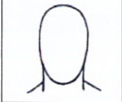
Face Shape :