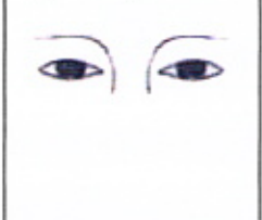
Eye Shape :