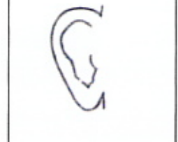
Ear Lobes :