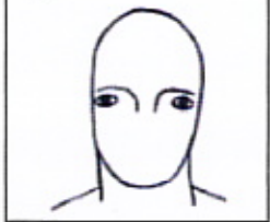
Eye Set :