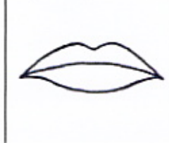
Lips Shape :